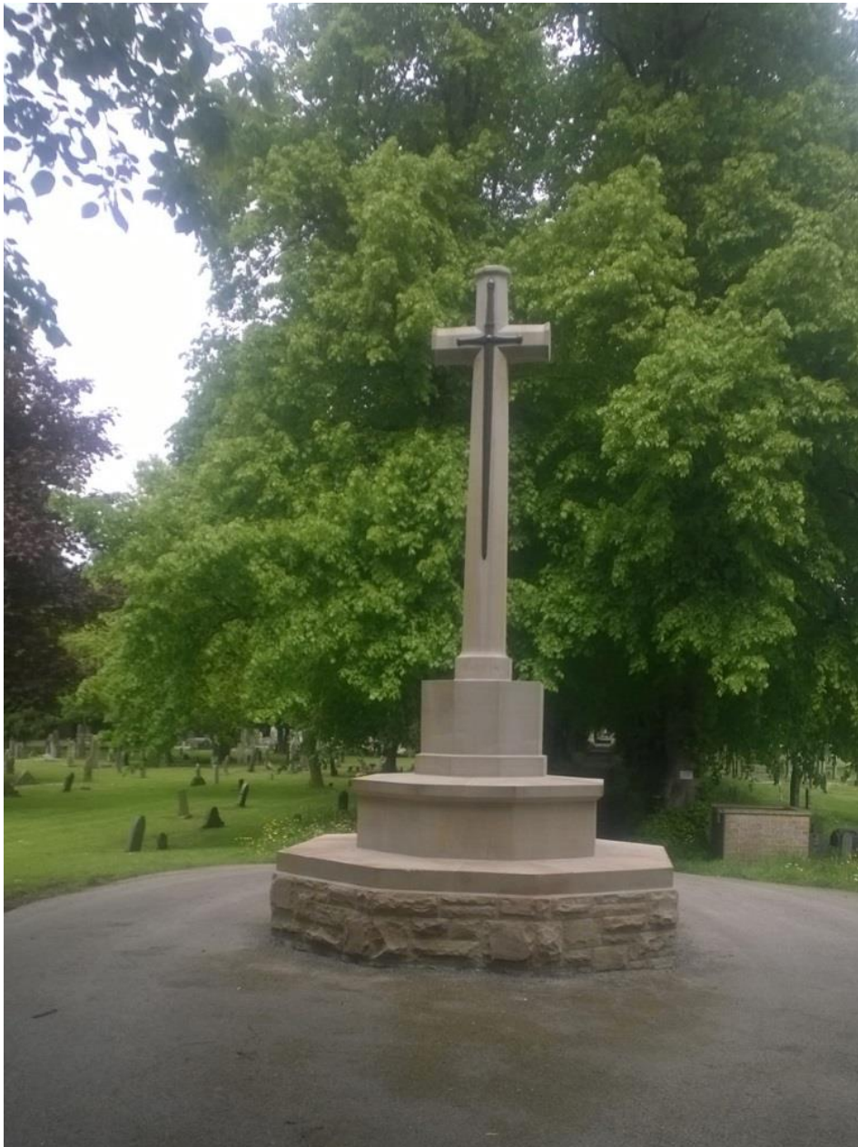
Cross of Sacrifice in Newark-upon-Trent Cemetery